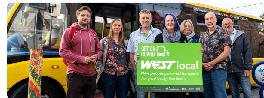
Members of the Chew Valley Community Interest Company Sustainable Transport Partnership and Chew Valley residents celebrating their new WESTlocal service.

Instagram @chewvalleysustainabletransport. Facebook group 'Bus Transition in the Chew Valley'. Email chew.valley.sprint@gmail.com